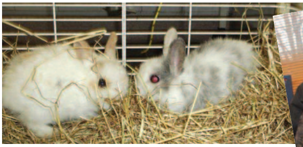
Dumped on the side of a motorway