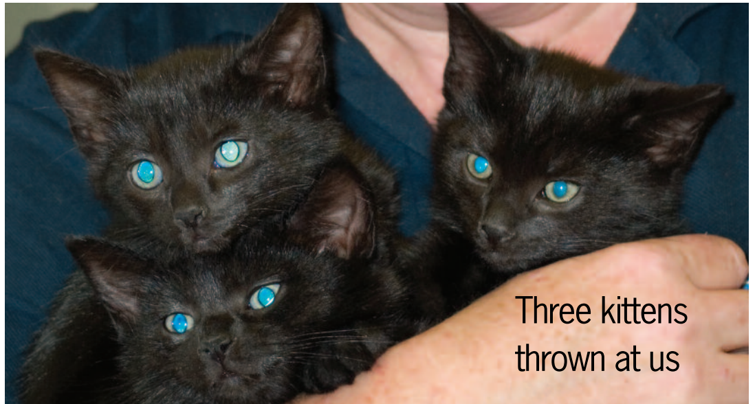
Three kittens thrown at us