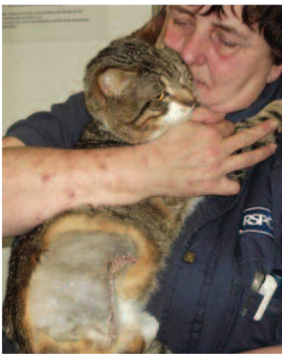
Hartley: Poor Hartley had to have his leg amputated. We have now found him a home with a fellow three-legged cat!

We booked him into the vets the following day for blood checks. All was well, kidney, liver and thyroid so that was our go head to give him all the help he needed. When he was found he was very wobbly on his legs but the vet says its due to neurological problems - unfortunately he will always be wobbly. Woody does have special needs and will be disabled for life but even so the lady who found him wants to adopt him. We are so very pleased he will have a loving, caring owner and we wish him well.