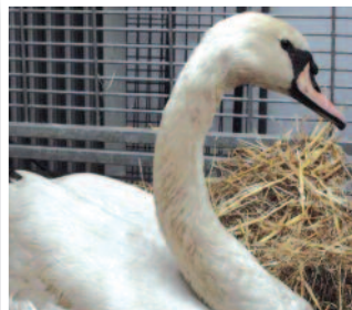
Hissing Sid: With us only a few days before going to an RSPCA wildlife centre.

Could you offer one of our animals a home? If you could, we would be delighted to hear from you