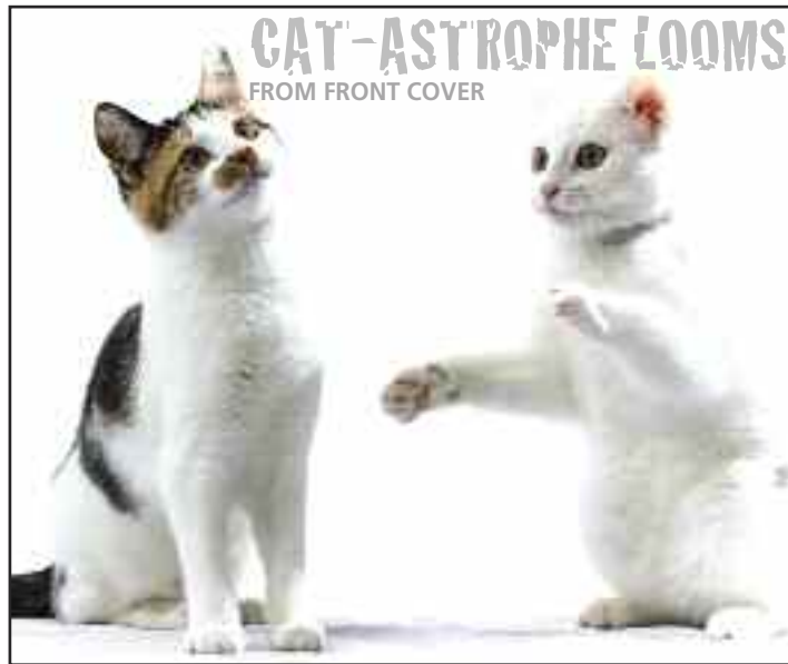
Evie and poor deaf little Pearl, lets hope that they can be rehomed together.