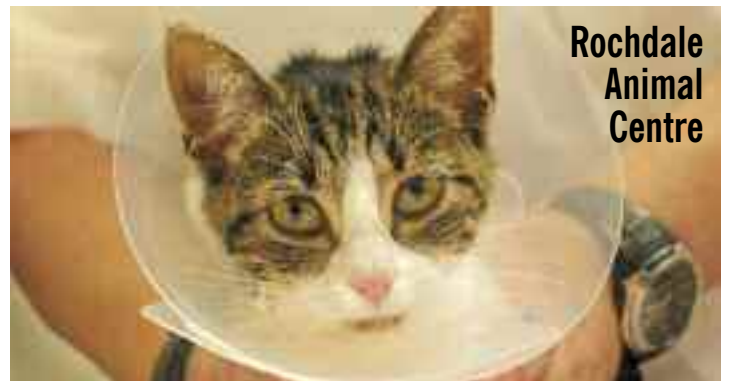
Rochdale Animal Centre

We are enclosing membership forms with this newsletter and urge you to become a member. If you are already a member please pass on this form to a friend, relative or a work colleague who may be interested.