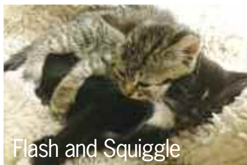
Flash and Squiggle

for them. We have called them Flash and Squiggle. They seem in good health but not quite eating solid food yet. They will make fabulous pets when they are old enough to be homed. The cat crisis never seems to end.