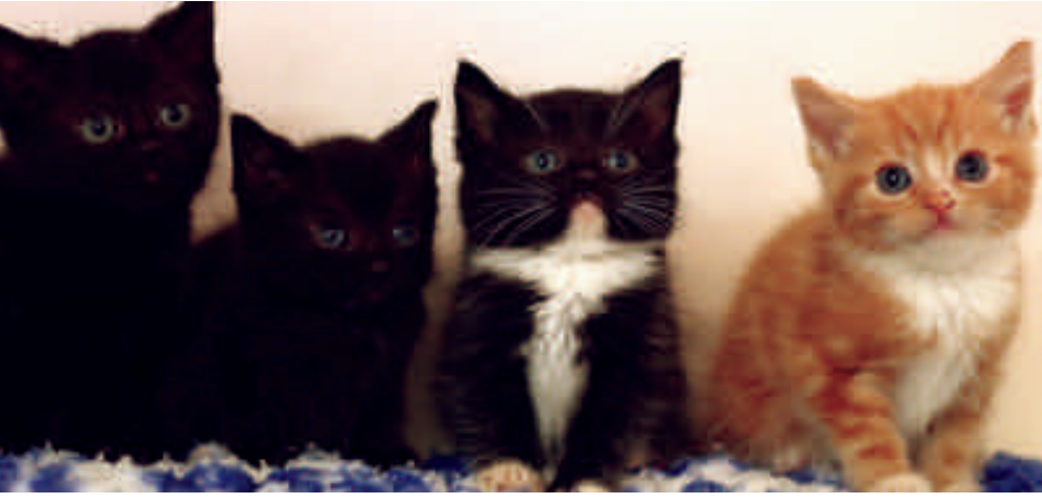
Abandoned by the young man who kept changing his story.

These are just a few examples of the cats and kittens we have had to take in. We have had around 100 kittens in this year that have either been dumped, or picked up by the inspectors. If only the queens to these kittens had been neutered.