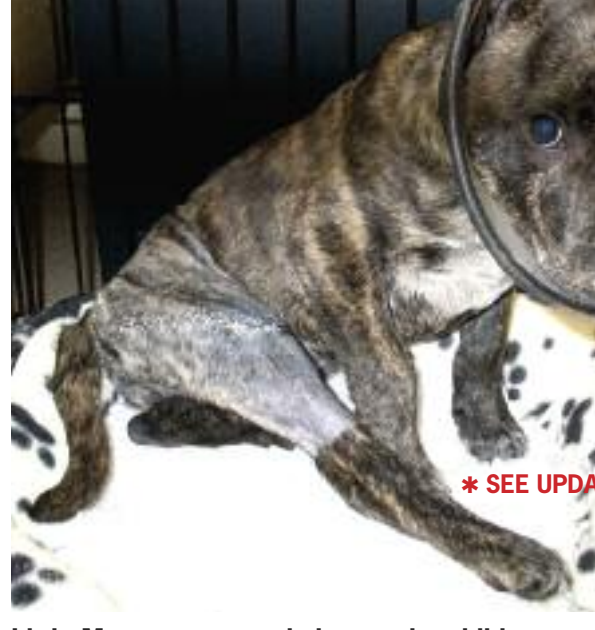
Little Meg was savagely beaten by children until stopped by a passer-by.

Our concern is not the abusers but the defenceless animals themselves. Don't hesitate to call the RSPCA hotline if you suspect an animal is in difficulty or you can ring the local branch for advice.