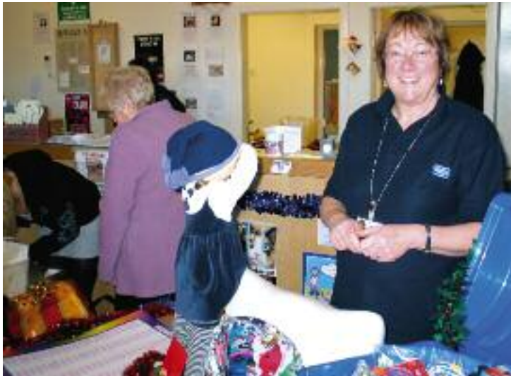
Some of our supporters at the Christmas Fair

Would you enjoy volunteer work at the Animal Centre, grooming animals or helping on reception? You would be working alongside the staff completing the day-to-day tasks such as cleaning, feeding, grooming and exercising of the animals, or working on reception, dealing with visitors and answering the phone. Many of our volunteers help just for the pleasure of being around animals whilst others volunteer to gain experience of working within an animal environment. Fridays, Saturdays and Sundays are busy days with the Animal Centre staff working flat out so if you could help on those days it would be wonderful. You will need to be aged 16 years or above, have a real love of animals, and be physically fit. Please ring 01706 861 897.