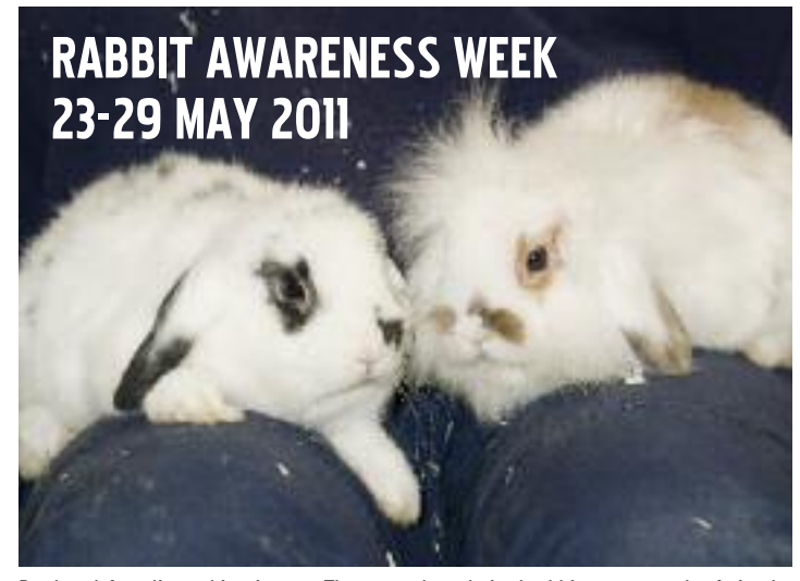
Brad and Angelina taking it easy. These two long haired rabbits came to the Animal Centre in January and, as you can see, don't intend to let anything disturb them.

A healthy lifestyle is essential for rabbits just as it is for us, Rabbit Awareness Week aims to promote just that.